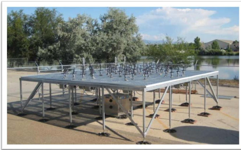
RAPTOR FBS-T Scalable Tropospheric, shown in 64-element configuration.

Filename: 5001190_FBS_antenna_models_v02.vsc