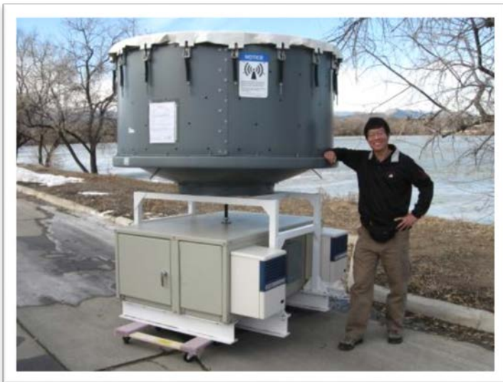
RAPTOR VPR-X Vertical Hydrometeorological Radar.