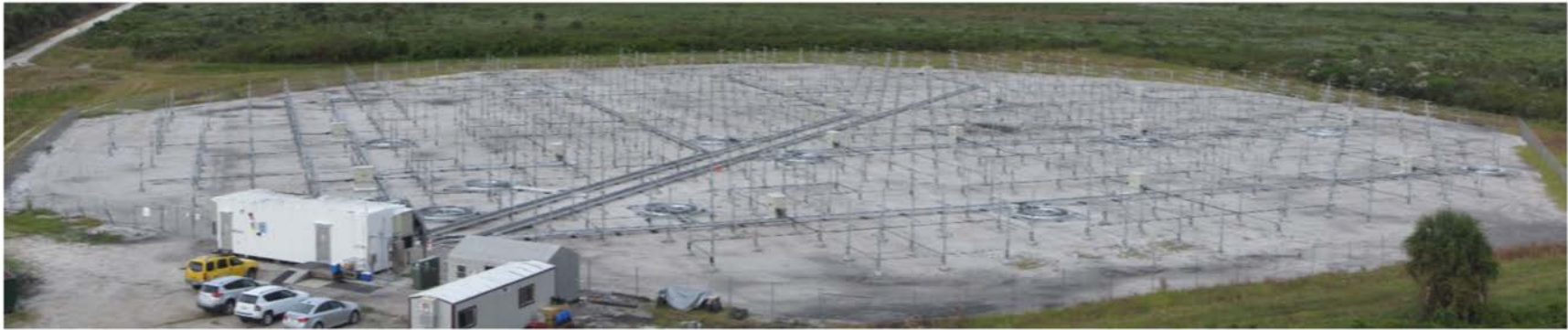
RAPTOR FBS-MST Scalable Mesospheric-Stratosphere-Troposphere 50 MHz Radar Wind Profiler. Installed for NASA Kennedy Space Center in 2014. Shown configuration uses 640 Yagi elements, 150 m diameter antenna, and 320 kW peak transmit power. Typical range is 20 km.

Radiometrics is the world's only manufacturer of radar wind, sodar, and thermodynamic total profiler solutions. For more than two decades, Radiometrics has provided hundreds of worldwide customers with atmospheric remote sensing systems, innovative software tools and technical support for operational forecasting, nowcasting, atmospheric research, and environmental monitoring.