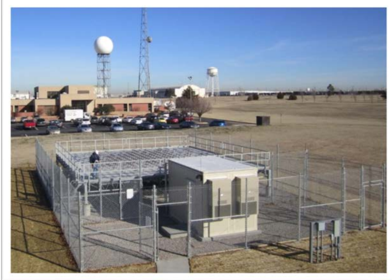
RAPTOR FBS-ST 256e-12kW Stratosphere-Troposphere Radar Wind Profiler designed and built for the US National Weather Service.