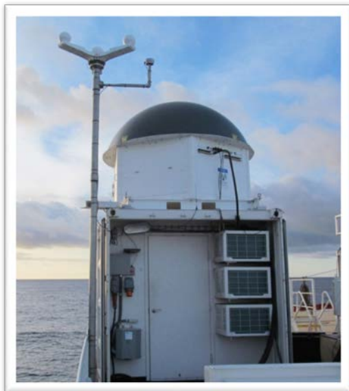
RAPTOR FMC-BL Shipborne RWP aboard container ship.