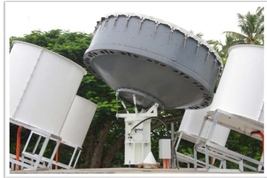
RAPTOR VAD-BL High-Performance Boundary Layer RWP with RASS.