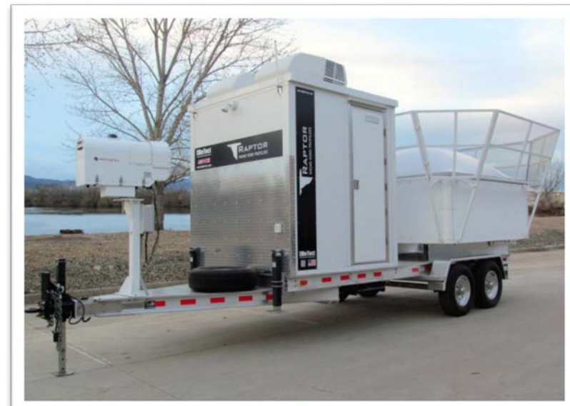
RAPTOR XBS-BL Portable Boundary Layer RWP with optional Radiometer.