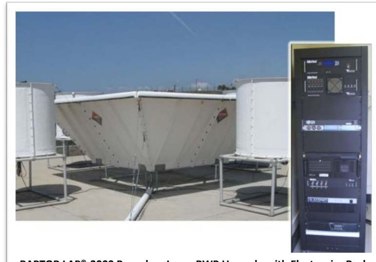
RAPTOR LAP®-3000 Boundary Layer RWP Upgrade with Electronics Rack.