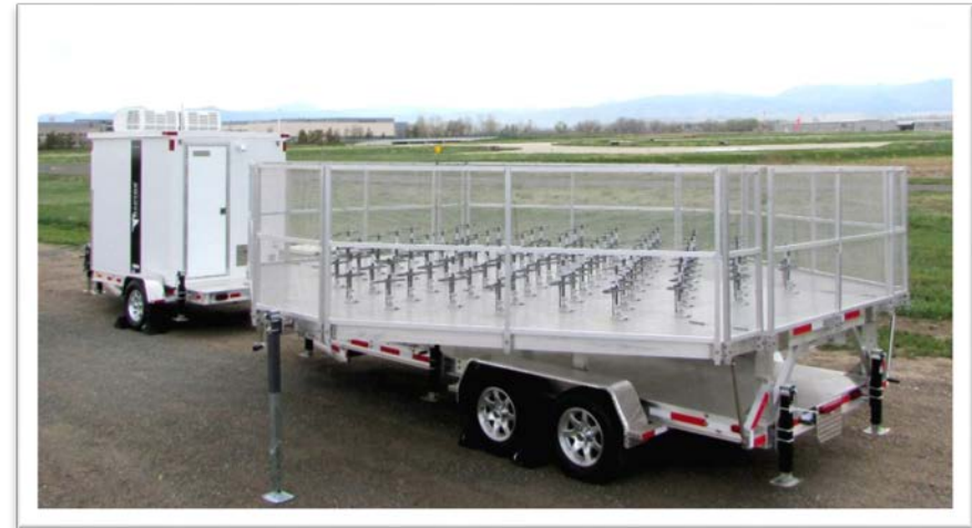
RAPTOR FBS-T 449 MHz 73e-2kW Tropospheric RWP antenna folded for transport (left) and set up for transmission (right).